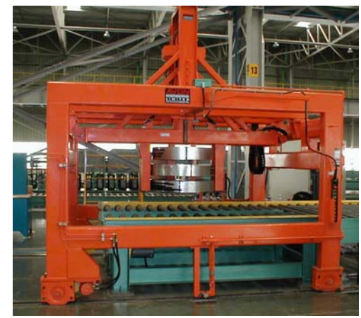
Travel lift stacker

High throughput packaging lines use automatic stacking and sorting to increase productivity and reduce labor needs. Automatic stacking and sorting can be provided using a sortation table with multiple stacking positions or a shuttle car system.