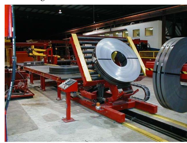
Pick & place downender

Coil downenders remove the coils from an eyehorizontal to an eye-vertical position for packaging. Most customers use a Pick & Place downender to improve productivity and reduce coil damage.