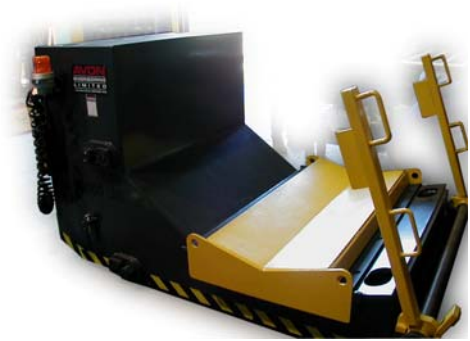
Slitting line exit end coil car