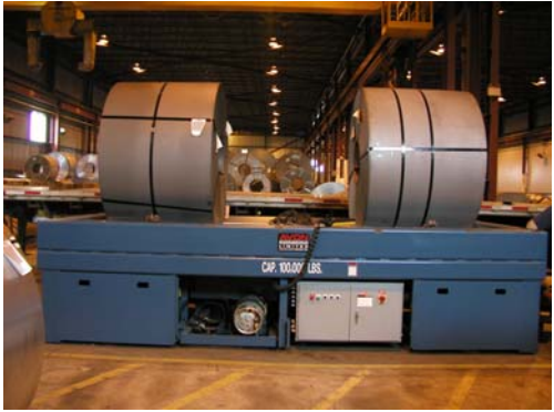
Propane powered master coil transfer car