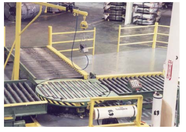
A weigh scale typically produces a "ticket" that is attached to the skid of coils. This "ticket" includes information such as weight, customer name, barcode, etc.