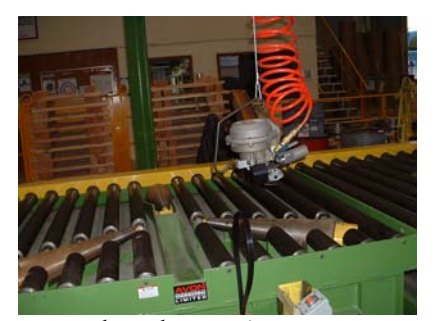
Manual steel strapping

Eye banding tables incorporate steel or plastic strapping systems with or without seals. Manual, semi-automatic and fully automatic options are available. Spin roll or iron cross style tables are available.