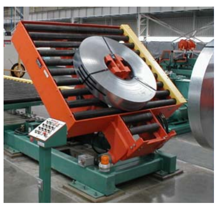
Fixed position downender

Fixed position downenders are better suited to heavy gauge coils. A pusher arm on the turnstile slides the coil on to the downender arm.