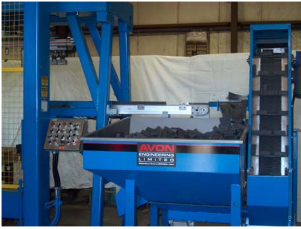
Automatic spacer placer

A spacer placer automatically places three or four wooden spacer blocks radially on top of a slit coil so that another coil can be placed on top. This allows multiple slit coils to be packaged together on a single pallet without being damaged. Coils can then be easily un-packaged and handled at the final destination.