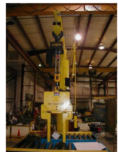
lib crane with coil ID lifter

Coil packaging lines with low throughput usually find manual coil stackers to be economical. Free standing jib cranes fitted with a coil ID lifter are frequently used to lift the eye banded coil and place it on a pallet.