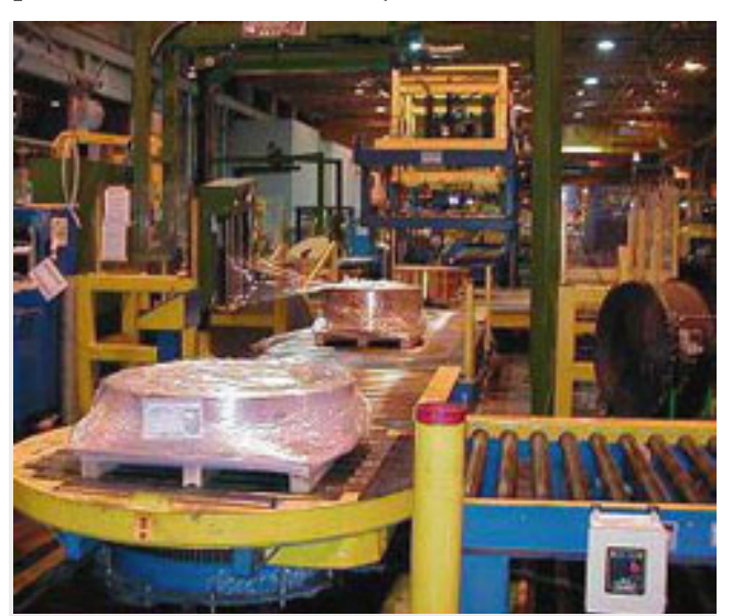
Non-ferrous coils wrapped in plastic film

Non-ferrous packaging utilizes control equipment that is PLC based with automation designed to be user friendly. Complete slit mult tracking systems are available for non-ferrous packaging and include interfaces to the slitter and to shop production/stock control systems.