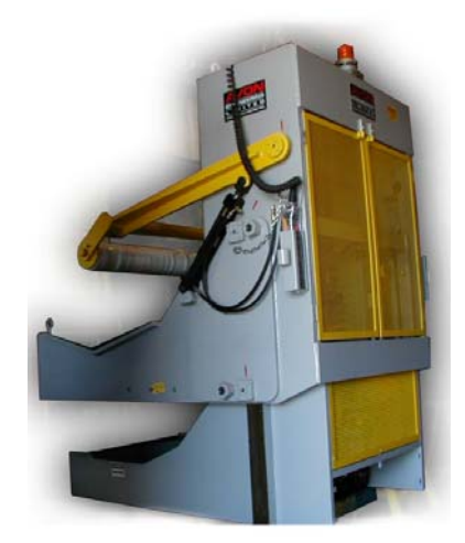
Slitting line entry end coil car

Slit mults may be transferred to the exit turnstile by coil transfer cars, Automatic Guided Vehicles (AGV), or an overhead crane with a C-hook. Photos of several types of coil cars are below.