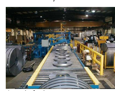
Auto indexing conveyor

Conveyors move the product to each stage of the packaging process. Space and price considerations frequently dictate the quantity of conveyors selected. More conveyors provide extra storage to free up the turnstile area as soon as possible without waiting for all the mults in a batch to be eye banded.