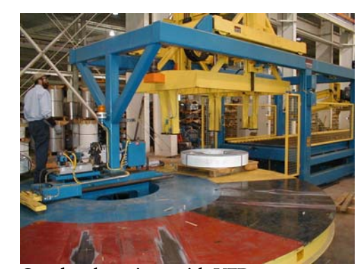
Overhead carriage with VFD