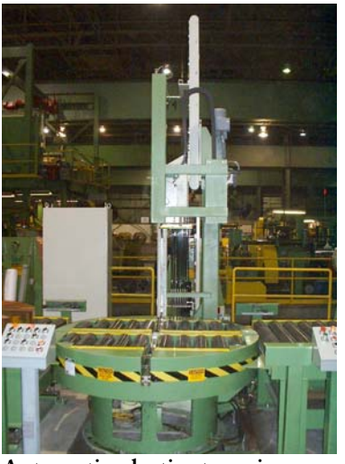
Automatic plastic strapping