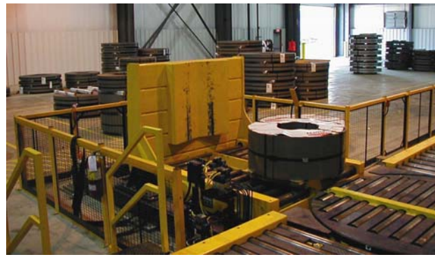
Coil tipping to eye-horizontal

Sometimes, after the coils are packaged in the eye-vertical position, they must be tipped up into the eye-horizontal position for shipping to the customer. Typically wide coils, greater than 15 inches, are shipped this way. An in-line upender will tip the coil stack through 90° to eye-horizontal position for removal by a C-hook or pole truck.