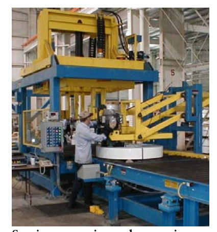
Semi-automatic steel strapping